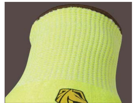
Seamless knit cuff for a comfortable fit