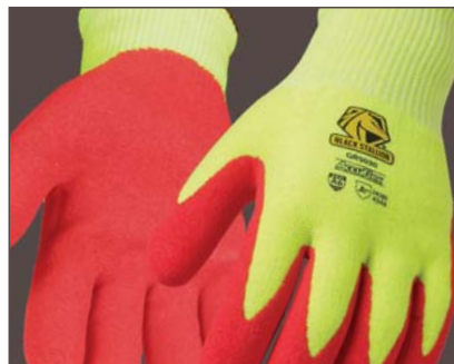
Hi-vis back & palm improves safety