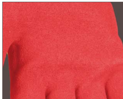
Sandy nitrile palm coating improves grip